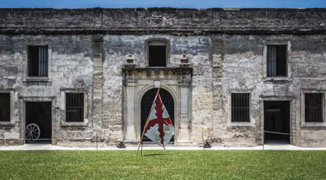
LEFT: This view shows an interior wall of the Castillo, built like a hollow square. BELOW: The Fountain of Youth Archaeological Park features Timucua re-enactors. BOTTOM LEFT: On the western shore of Matanzas Bay on Florida's northeast coast, the bell tower at the Castillo greets another dusk.

at Fort Caroline (est. 1564); convert the Timucua Indians; and establish a settlement. Menéndez accomplished all three.”