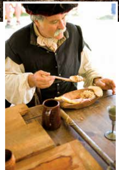
TOP: The walls of the ancient Castillo de San Marcos date to 1695. ABOVE: A re-enactor samples 16th-century food.